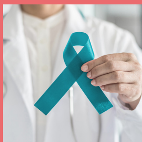
Cervical Health Awareness Month