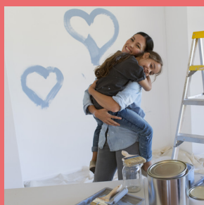
American Heart Month