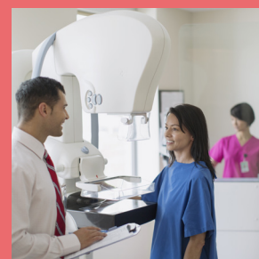
World Cancer Day