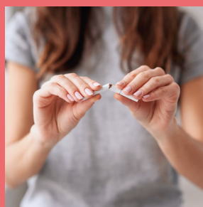
National Drug & Alcohol Facts Week